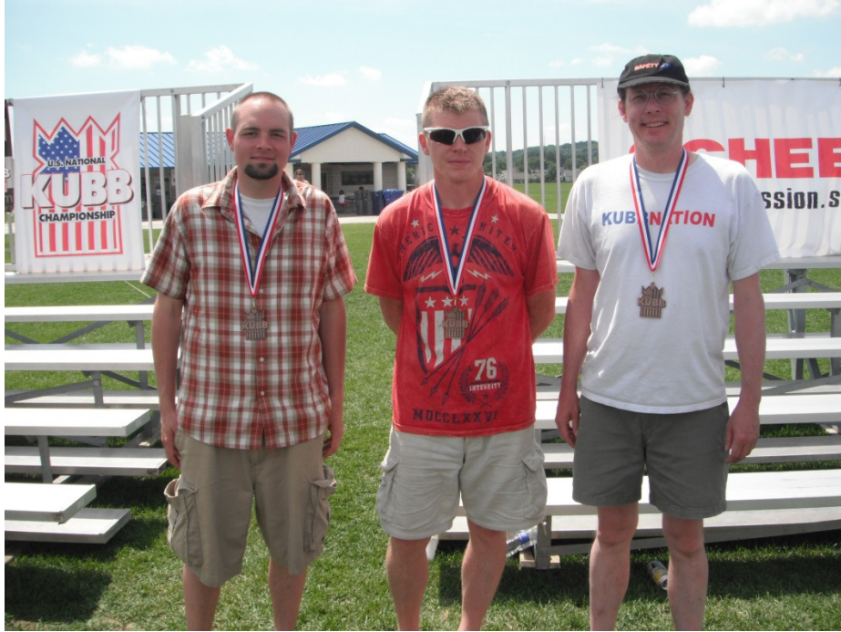
4th Kubbitz Eau Claire, WI