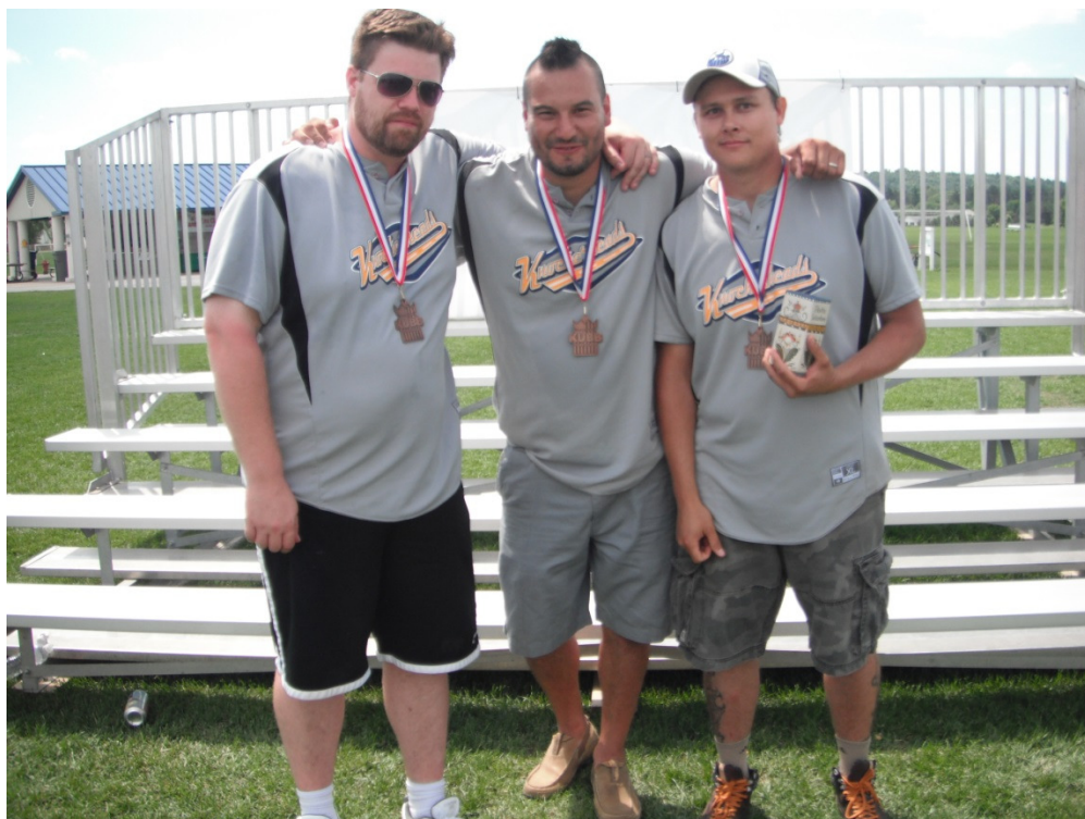
3rd Team Knockerheads Des Moines, IA