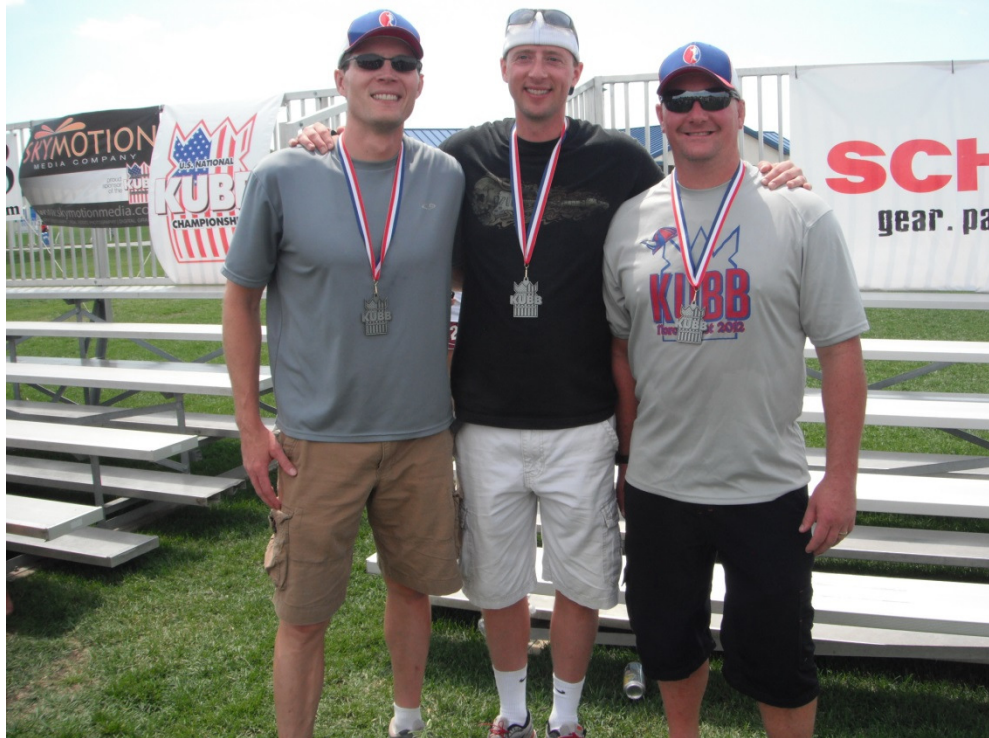
2nd King Pin Chaska, MN