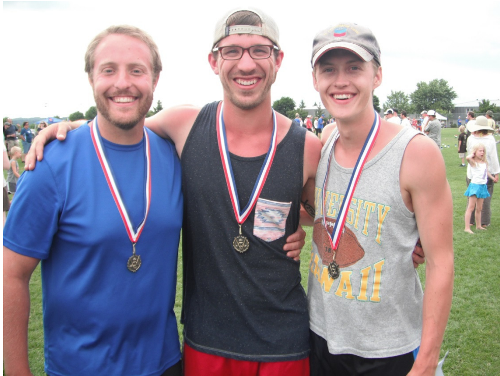
2 nd Consolation Winner Team Hipsterfresh Minneapolis, MN / Chicago, IL