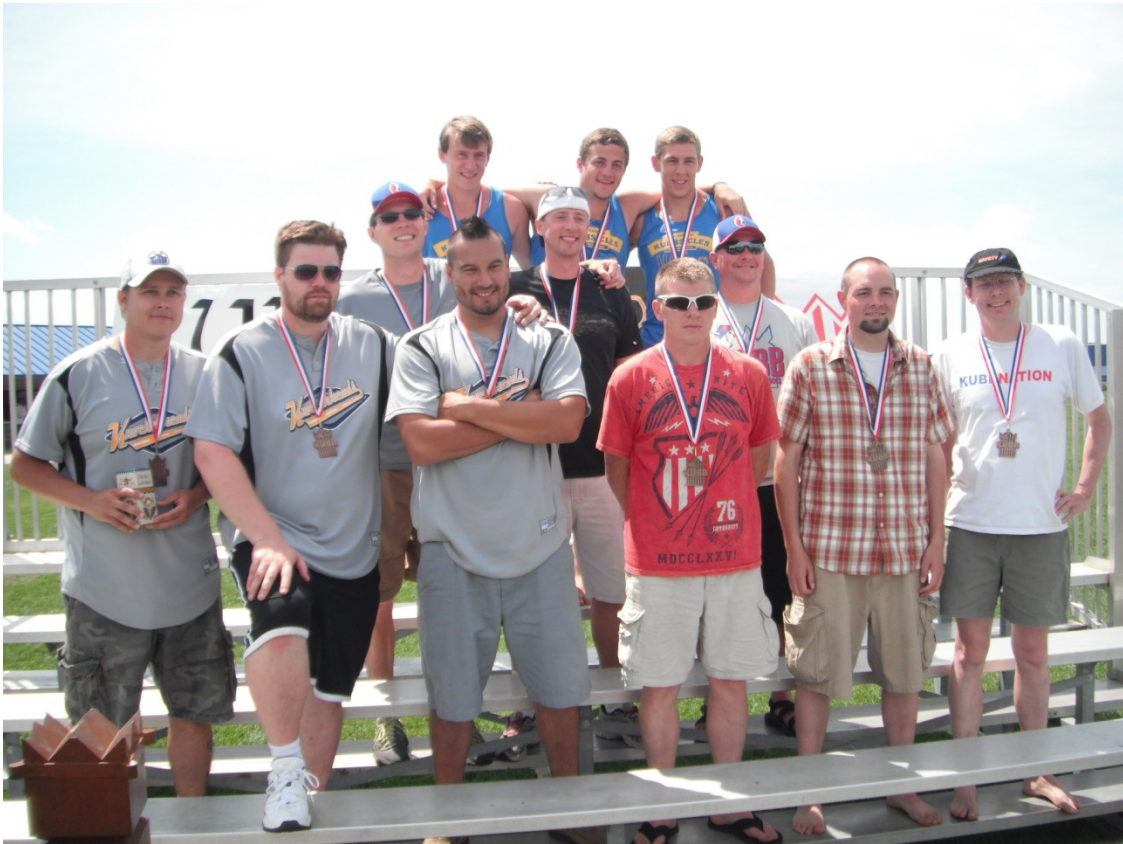
2012 Top Four