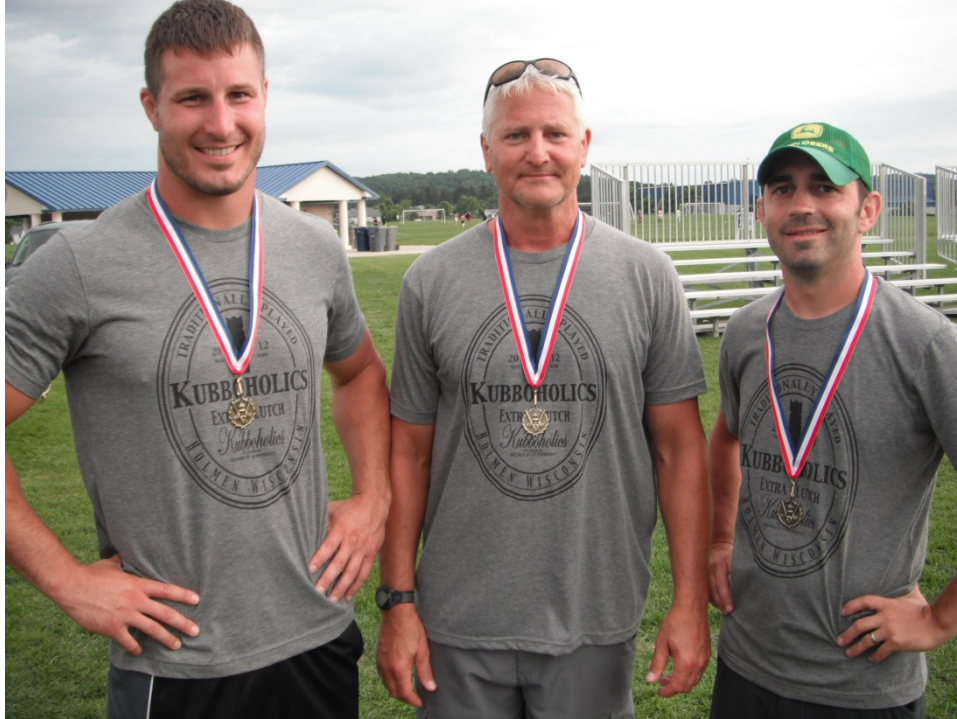
Consolation Winner Kubboholics Holmen, WI